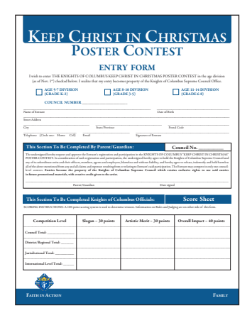
Keep Christ in Christmas Poster Contest Entry Form (#5025)

These items can be ordered through Supplies Online, which can be accessed in the Officers Portal.