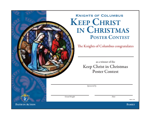
Keep Christ in Christmas Poster Contest Winner Certificate (#5022)