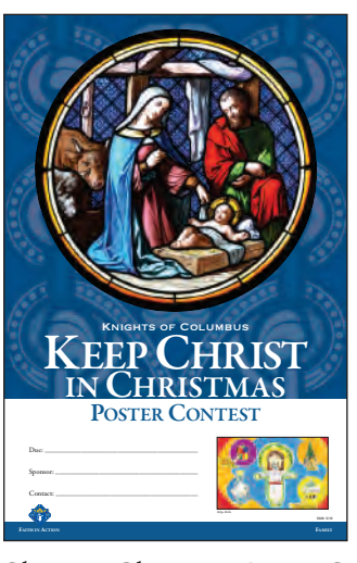
Keep Christ in Christmas Poster Contest Poster (#5026)