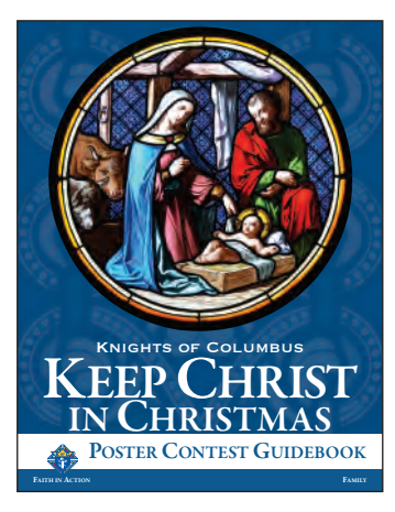
Keep Christ in Christmas Poster Contest Guidebook (#5024)