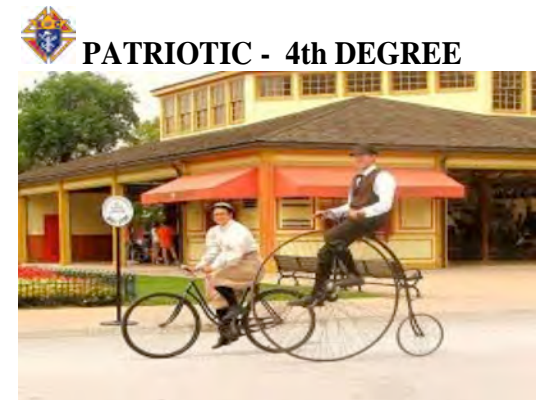
DEARBORN INN 4 Guests / 2 Nights / 2 Rooms * Includes Breakfast, Guest Passes to Henry Ford Museum, Greenfield Village Or The Rouge Plant