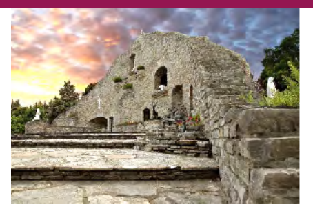
Our Ladv of the Woods Shrine in Mid. Michigan

Built as a symbol of their faith; restored as a symbol of ours: The Our Lady of the Woods Shrine (The Shrine) celebrates its 65th anniversary in 2020.