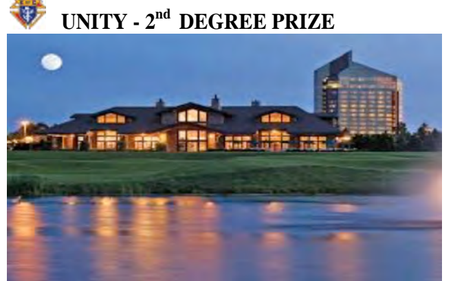
GRAND TRAVERSE RESORT BAYVIEW ROOM – 4 Guests / 2 Nights / 2 Rooms PLUS $3,500.00 CASH