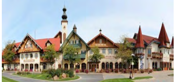
BAVARIAN INN, FRANKENMOUTH / LITTLE BAVARIA – 4 Guests / 2 Nights / 2 Rooms & 4 Waterpark Wristbands

PLUS $2,500.00 CASH 5^{TH} - 10^{th} Prizes = $300.00 21^{st} - 30^{th} Prizes = $120.00