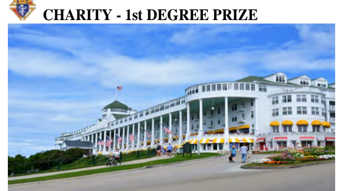
GRAND HOTEL, MACKINAC ISLAND 4 Guests / 2 Nights / 2 Rooms *Includes Breakfast and Dinner ** Excludes Holiday Weekends