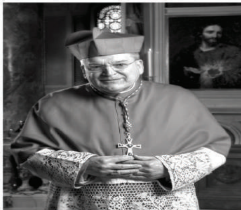
Raymond Leo Cardinal Burke, founder of the Shrine of Our Lady of Guadalupe, La Crosse, Wisconsin; former Archbishop of St. Louis; Patron of the Order of Malta; International Director of the Marian Catechist Apostolate; and a member of the Supreme Tribunal of the Apostolic Signatura.

5:00 - 6:00 pm, Assumption Grotto Church 13770 Gratiot Avenue Detroit, Michigan