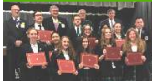
Officers of St. Kieran Council 13983 in Shelby Township visit Austin Catholic High School to present the winners of the 2018 Catholic

Essay Contest with their prizes. Over 80% of the student participated in this year's contest. Following the presentation of the student's recognitions, the council presented the school with a $1,000 donation towards the construction of their new chapel.