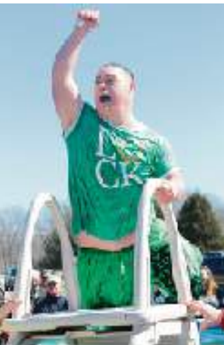
Degree Knight