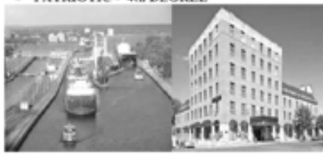
HISTORIC OJIBWAY HOTEL, SAULT SAINT MARIE, MI 4 Guests / 2 Nights / 2 Rooms