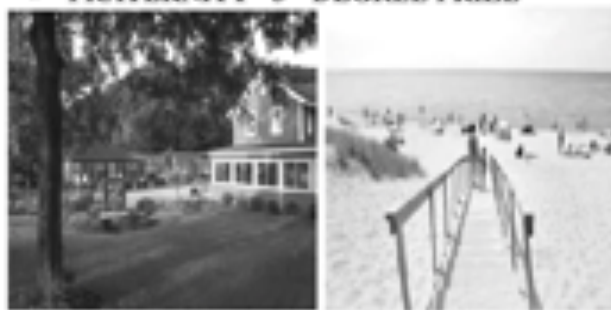
HOTEL SAUGUTUCK, BED AND BREAKFAST, SAUGUTUCK, MI 4 Guests / 2 Nights / 2 Rooms