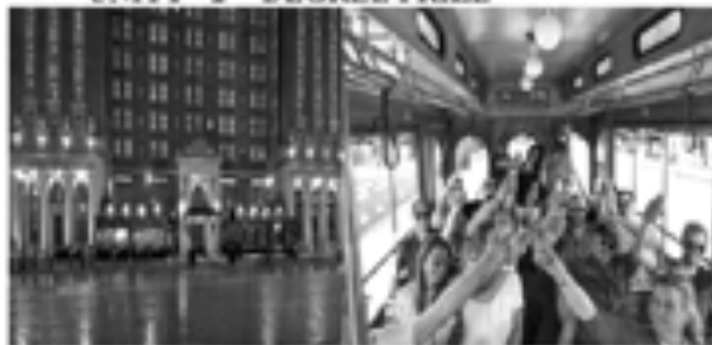
AMWAY GRAND HOTEL, GRAND RAPIDS, MI 4 Guests / 2 Nights / 2 Rooms *Includes Guided Beer Tour with Transportation