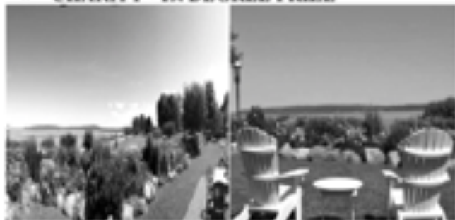
STAFFORD PERRY HOTEL, PETOSKEY, MI 4 Guests / 2 Nights / 2 Rooms * Deluxe King Room with Balcony and Lake View