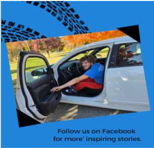
Follow us on Facebook for more inspiring stories.