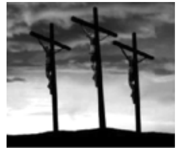
Good Friday April 15 2022