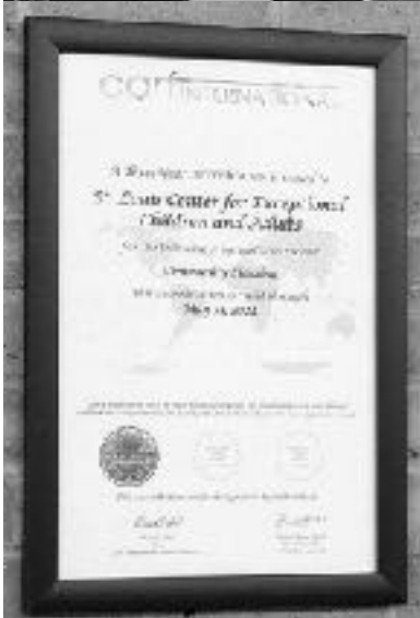
View of the official CARF Reaccreditation certificate.