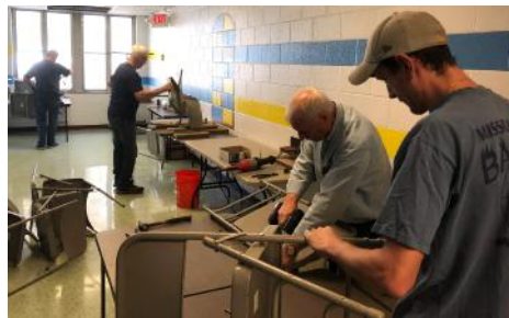
Knights of Columbus Council #9711 of St.

Casimir Parish in Lansing, Michigan are proud to announce the completion of the Save the Chairs Project! Knights and other Parish volunteers gathered on Saturdays through late October through December to repair and strengthen over 200 of the churches folding chairs.