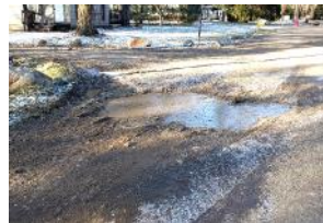
An 11 ft. wide, 1 ft. deep wash-out on Florman Road

The end result is a durable road surface that will prevent washout and provide safe travel for the residents through the spring thaw. Soon after, we'll return with digging bars, shovels, and a tractor to grade all the hard work into the permanent roadbed.