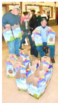
Boxes used for carrying your bear home

This free event was open to the community we had a waiting line of 2 hours. Nothing but happy faces. Each child received a bear and carrying box.