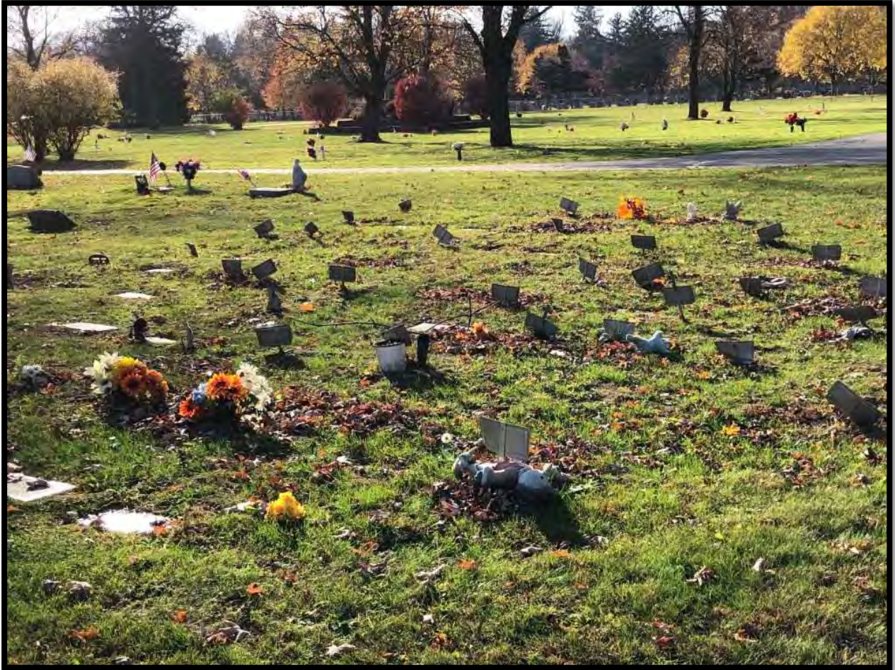
More Temporary Markers

The project was formally begun in the spring of 2021. The first phase of the project was to create and initiate a fund-raising drive for the entire cemetery highlighting the priority of Babyland. The mailing resulted in raising $45,000, of which $15,000 was specified by some donors for the Babyland project. We were overwhelmed and grateful, praising God's blessings!