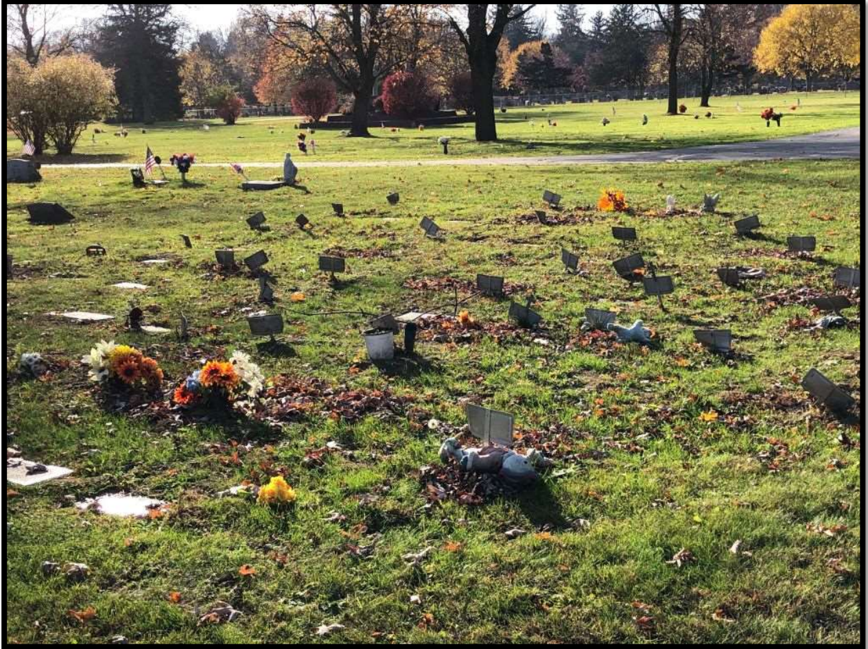
More Temporary Markers

The project was formally begun in the spring of 2021. The first phase of the project was to create and initiate a fund-raising drive for the entire cemetery highlighting the priority of Babyland. The mailing resulted in raising $45,000, of which $15,000 was specified by some donors for the Babyland project. We were overwhelmed and grateful, praising God's blessings!