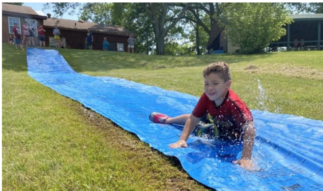
Enjoying a hot summer day at camp!