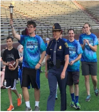
Summer Games opening at CMU