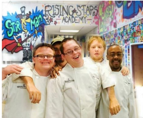
Developing Skills in the Community