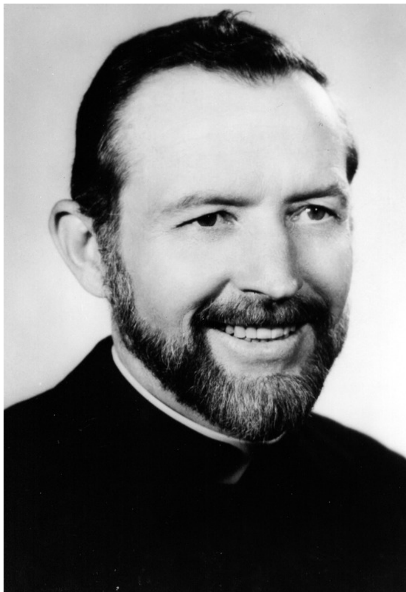
The Order celebrated the beatification of missionary Father Stanley Rother, the first U.S.-born martyr, Sept. 23.