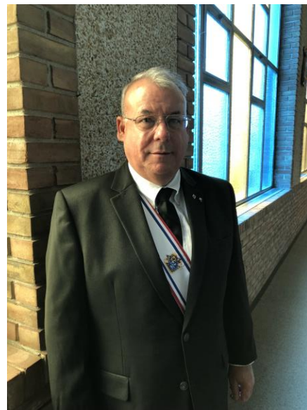
Brother Knights, Vivat Jesus!!!

We have so much to be thankful for. I am thankful that God has blessed me with a wonderful Family and a wonderful Brotherhood with K of C Council 3830!!! There is nothing better in life than being surrounded by good people. We as Brother Knights make that possible not only for ourselves, but for our friends and families too. So, Brothers continue setting that fine example of Charity, Unity, Fraternity and Patriotism. Have safe and "Happy Christmas" and "Prosperous New Year"!!!