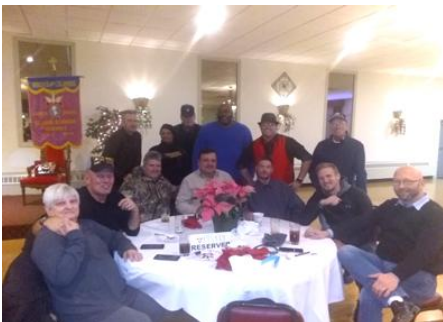
Vets Returning Home residents gather for a picture with one of the carolers

The Assembly donates a total of $2,000.00 to Vets Returning Home throughout the year to assist the shelter with its operating expenses, as well as usable household items for the veterans' use as they graduate to apartments of their own.