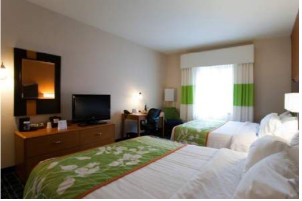
HOTEL AMENITIES & SERVICES: